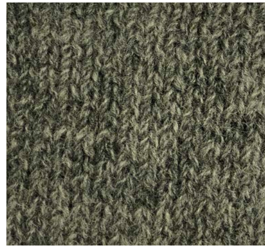
SHETLAND Available in Nm 8.4/1 & Nm 8.4/2 100% PURE NEW WOOL 54 SHADES