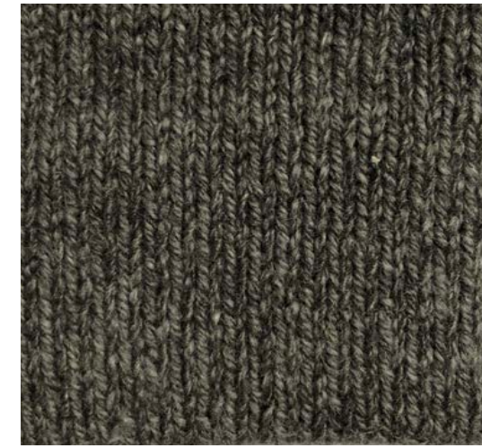
GALANTA LOMHARA Available in Nm 6/2 69% MERINO 21% ALPACA 5% CASHMERE 5% SILK