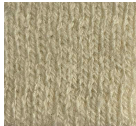
HERITAGE Available in Nm 6/1, Nm 6/2, Nm 6/3 100% PURE NEW WOOL