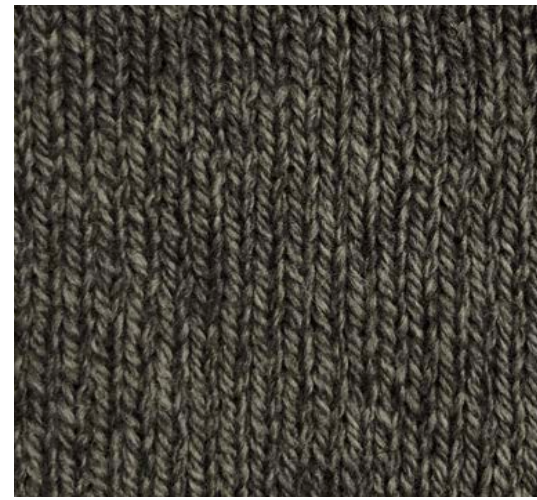
COAST Available in Nm 14/2 55% LAMBSWOOL 45% COTTON 63 SHADES