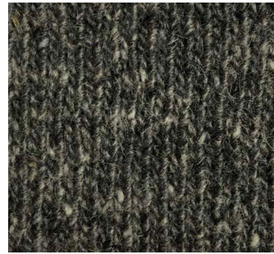
MOHAIR TWEED Available in Nm 4/1 70% WOOL 30% MOHAIR 36 SHADES