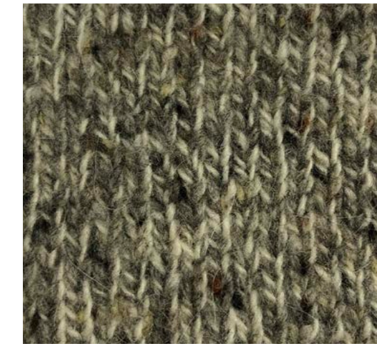
ALPACA TWEED Available in Nm 2.3 83% MERINO 17% ALPACA