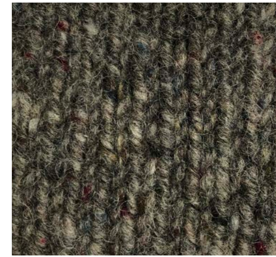
KILCARRA TWEED Available in Nm 1.6/1 100% PURE NEW WOOL 45 SHADES