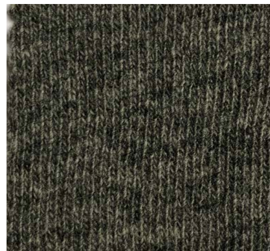
NOBLE Available in Nm 20/1 & Nm 20/2 95% EXTRA FINE LAMBSWOOL 5% CASHMERE 54 SHADES