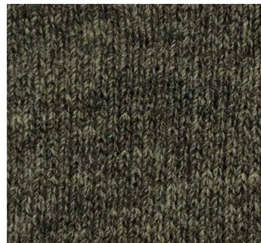
FINESSE Available in Nm 15/1 100% PURE MERINO WOOL 42 SHADES