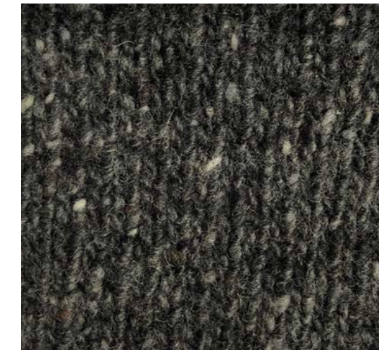
SOFT DONEGAL Available in Nm 3.8/1 & Nm 3.8/2 100% PURE MERINO WOOL 54 SHADES