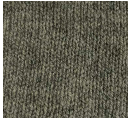
LAMBSWOOL Available in Nm 17/2 100% PURE MERINO WOOL 96 SHADES