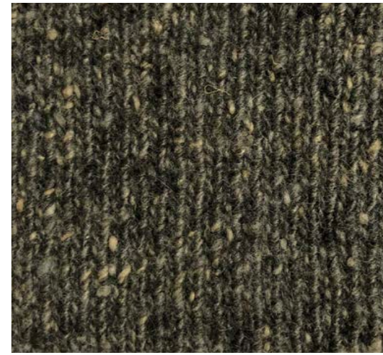
GALANTA Available in Nm 6/1 & Nm 6/2 80% MERINO 10% CASHMERE 10% SILK 18 SHADES