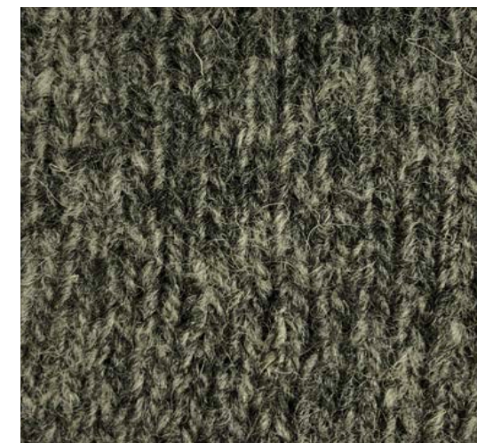
HERITAGE HEATHER Available in Nm 6/1, Nm 6/2, Nm 6/3 100% PURE NEW WOOL 12 SHADES